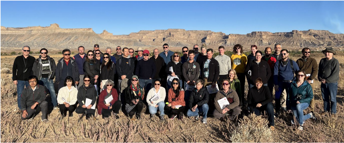
Photo: Day 4 - Participants pose in front of the classic Battleship Butte outcrops near Green River.