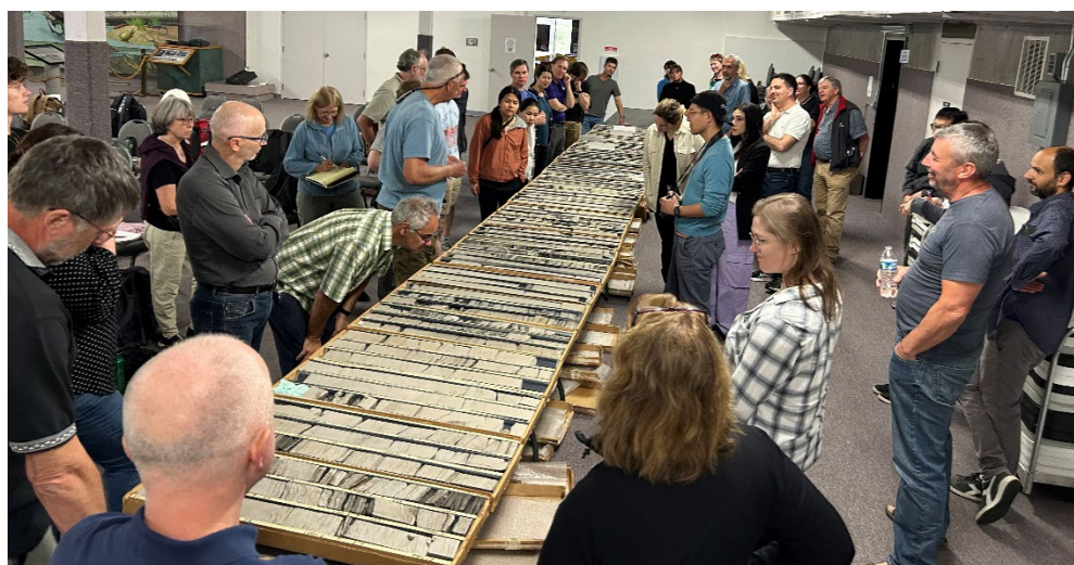
Photo: Day 2 - Participants inspect and discuss the Thompson Canyon, Desert Member core at the conference venue.

An evening outing for the group to view the Floy Canyon to Blaze Canyon face in the setting sun was followed by the conference dinner at Ray's Tavern.