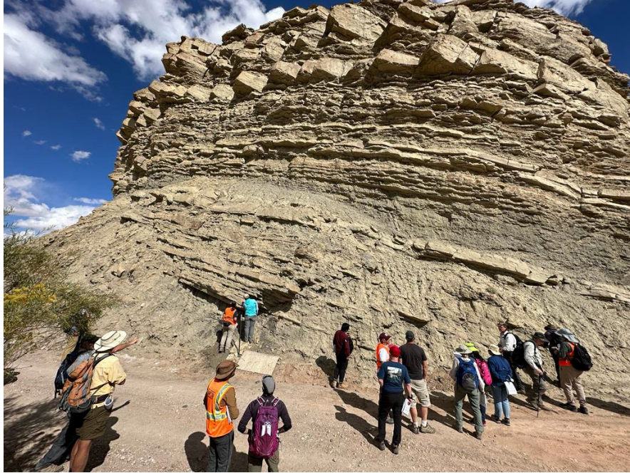
Photo: Day 3 in the field. Janok Bhattacharya talks participants through parasequences in the Notom Delta.

Day 4 kicked off with an early morning outing towards Battleship Butte to view the Kenilworth Member shoreface facies change. The low-angle morning sunshine also provided the perfect opportunity for a group photo (see below).