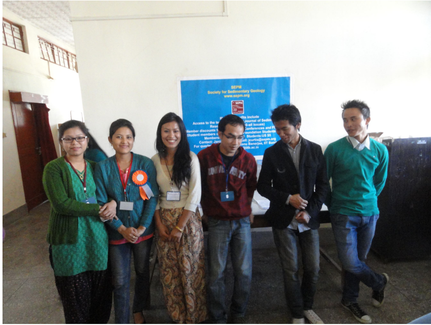
Enthusiasms of students at the SEPM booth