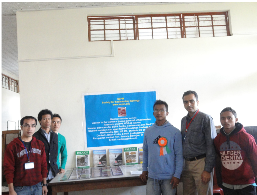
SEPM ambassador with the student participants and volunteers