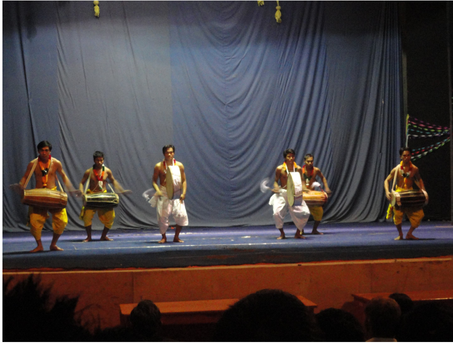
A view of the Cultural program