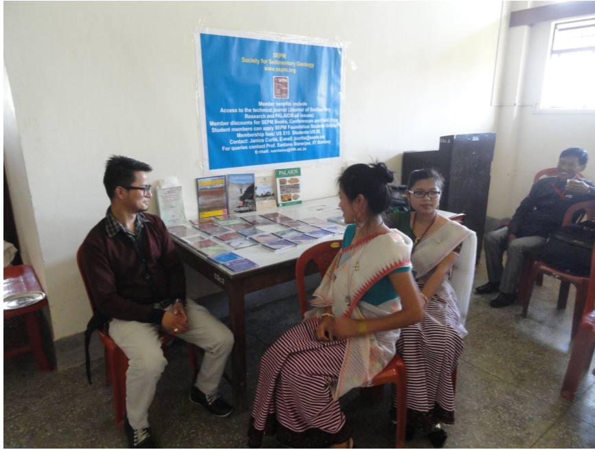
Prospective SEPM student members at the SEPM booth