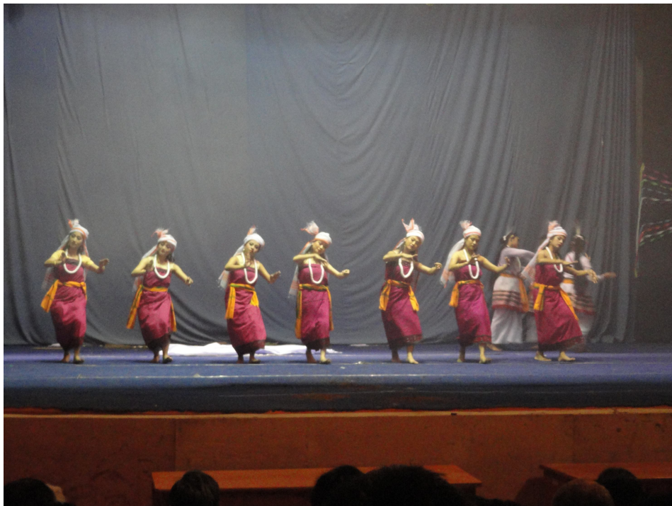
Manipuri dance during the cultural program at night