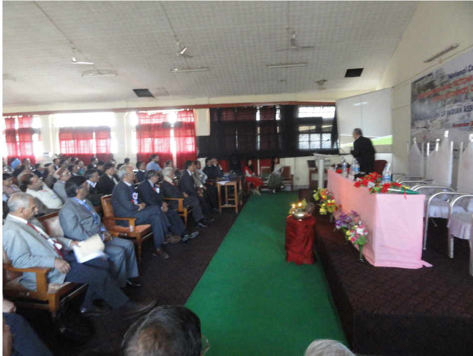
Section of the audience during an invited talk